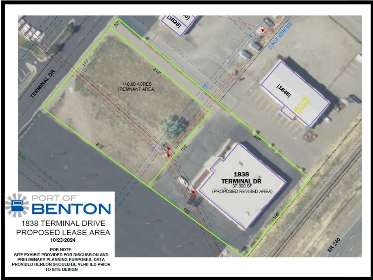
EXHIBIT A Resolution 25-07 0.86 Acres (37,800 sf)/ 1838 Terminal Drive