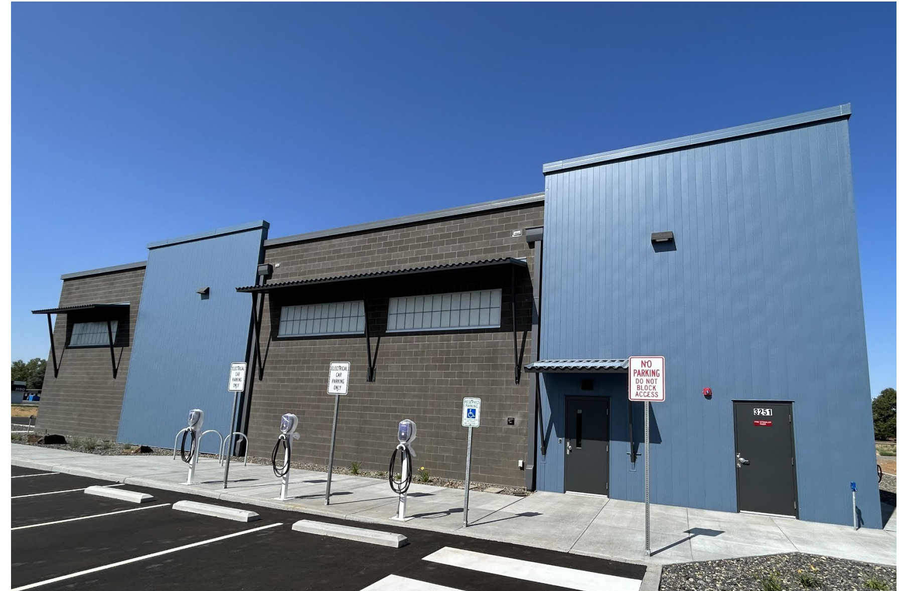
White Bluffs STEM Center Phase 1