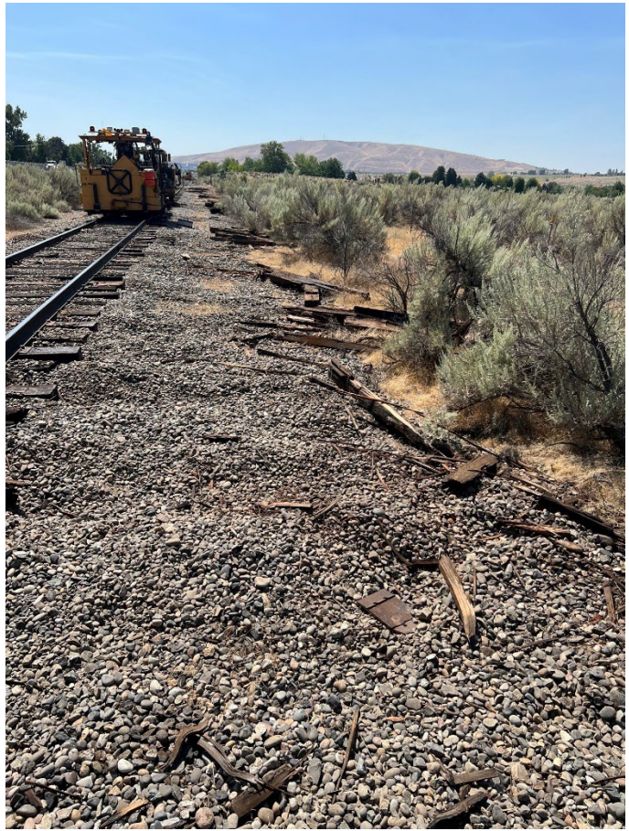
Old removed ties and disturbed ballast