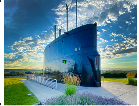
USS TRITON SAIL