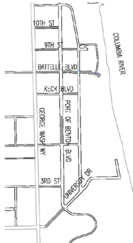
PORT OF BENTON NORTH RICHLAND