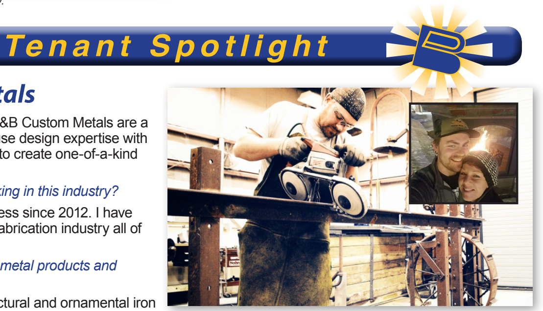
B&B Custom Metals is located at 2700 Salk Avenue in Richland

The Schultz's have 10 employees and also own and operate KC Brand Kettle Corn in Richland.