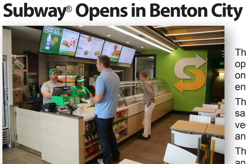
Subway is now open for business in the Port of Benton's development building at 515 9th Street in Benton City.

The Experimental Aircraft Association Young Eagles hosted a pancake breakfast as the kickoff event. Cascade Range Photography took pictures of attendees who dressed up in 1940s war bird and top gun pin-up looks, with hair and makeup by Zoey and Deann. All proceeds went to the Ninety-Nines Women Pilots Foundation.