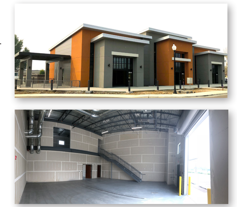
Space in the recently completed building at Vintner's Village in Prosser is now available for lease. Contact the Port for more information.