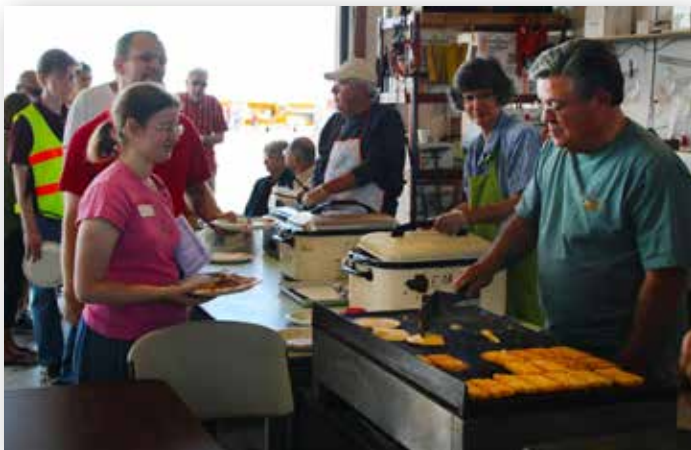
Spectators enjoyed the event at the Richland Fly-in which included a pancake breakfast and vintage airplanes (photos bottom left and right).