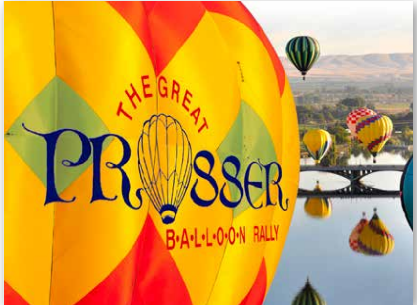
Balloons lifted off into the quiet morning sky over Prosser during the Great Prosser Balloon Rally.

Viewers arrived early as the balloons lifted off into the quiet morning sky. Each balloon has an FAA approved pilot including a few with commercial ratings.