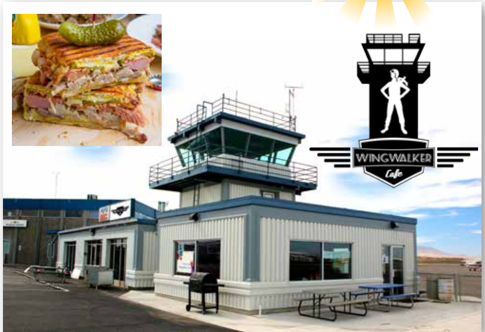
Wingwalker cafe is located at the Richland Airport under the air traffic control tower.

we will eventually have our beer offered up, possibly with clever aircraft names.