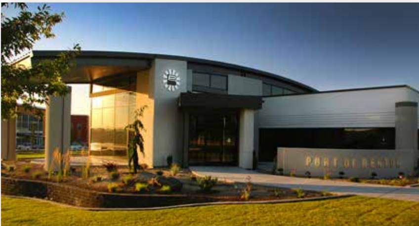
Port of Benton building located next to the Columbia River in North Richland is open for business.

After six months of construction and remodel of the 23,000 square foot former SAIC building, the Port of Benton moved into its new administration building May 2014. The new facility, designed by ALD Architects, P.S., features large, arching roof spans and many windows that view the Columbia River and Triton Sail. Located on Port of Benton Boulevard the new space provides ample meeting and office space for an efficient and productive workflow.