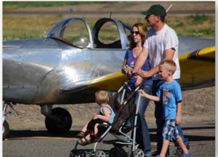
The Prosser Fly-in was enjoyed by kids of all ages. It featured a large variety of antique, modern and experimental planes (above photos)