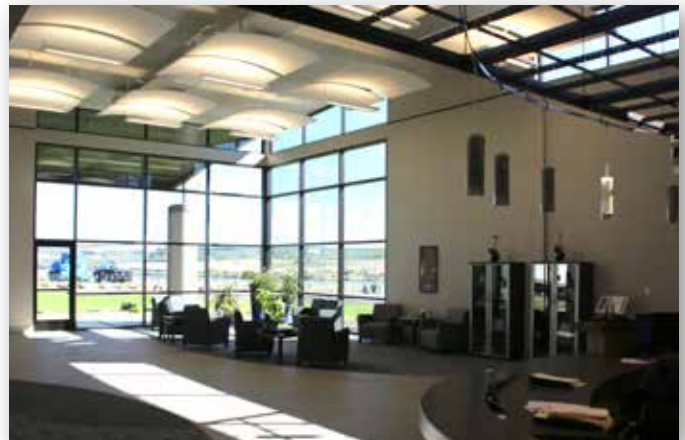
The Port of Benton's new administration building lobby (above), the port's maintenance staff preparing for new tenant signs and landscaping work (below).

For more information contact: Diahann Howard, 375-3060.