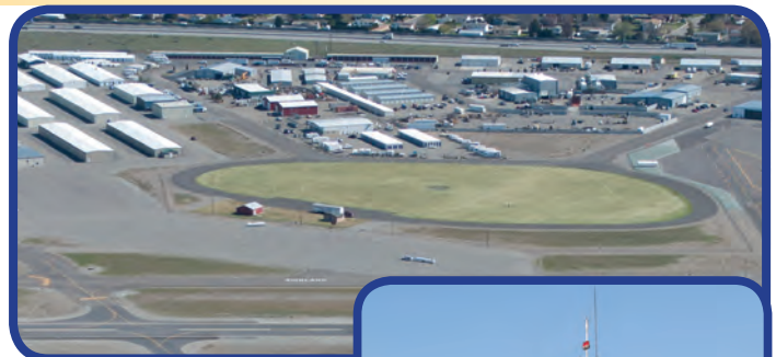
The circular area at the Richland Airport, shown above, will be converted into hangar space and taxiway B will be relocated and link to the hangar area.

The Prosser Airport AWOS system will include: wind speed, wind gust, wind direction, variable wind direction, temperature, dew point, altimeter setting and density altitude. The system will report at 20-minute intervals but will not report special observations for rapidly changing weather conditions. The AWOS system can be accessed by phone or radio frequency.