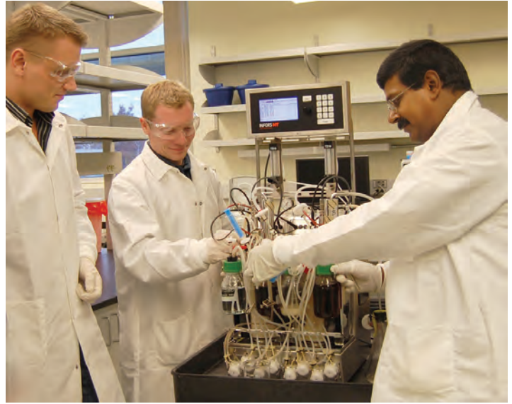
Photo shows scientists at WSU-TC's Bioproducts, Science & Engineering Laboratory.

The Port of Benton, Benton County, City of Richland and TRIDEC have begun the process of transitioning Hanford lands for industrial uses in order to serve new missions such as clean energy and biofuels. The land request is only one part of a larger effort led by the Mid-Columbia Energy Initiative.