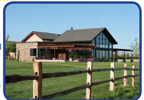
The Vineyard Pavilion is available for rental by calling the contact below.

The design will complement the Clore Center's natural surroundings overlooking the Yakima River in Prosser. The 15,000 square foot wine/agritourism center will offer several indoor and outdoor venues including a tasting room, demonstration kitchen, agriculture and viticulture exhibits, classrooms, conference rooms, office space,