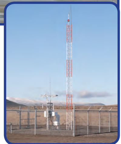
The photo at right shows the Automated Weather Observing System at the Richland Airport. A similar system will be installed at the Prosser Airport this year.